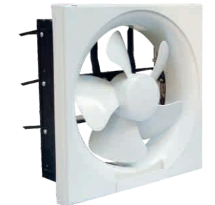
Names of Parts and Installing Dimensions(mm)