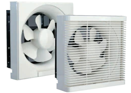
Names of Parts and Installing Dimensions(mm) 部件名称及安装尺寸